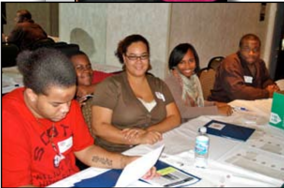
Speakers and participants at YEP's Second Annual Youth Housing Summit on December 15.