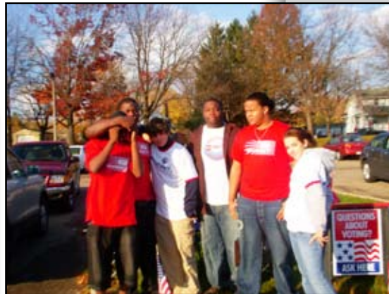
YEP youth work to GOTV in Cleveland.