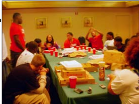
YEP youth report out about election in Akron meeting.