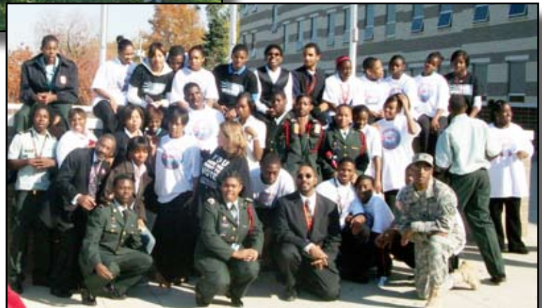
Shaw students serving as poll monitors in East Cleveland on Election Day.