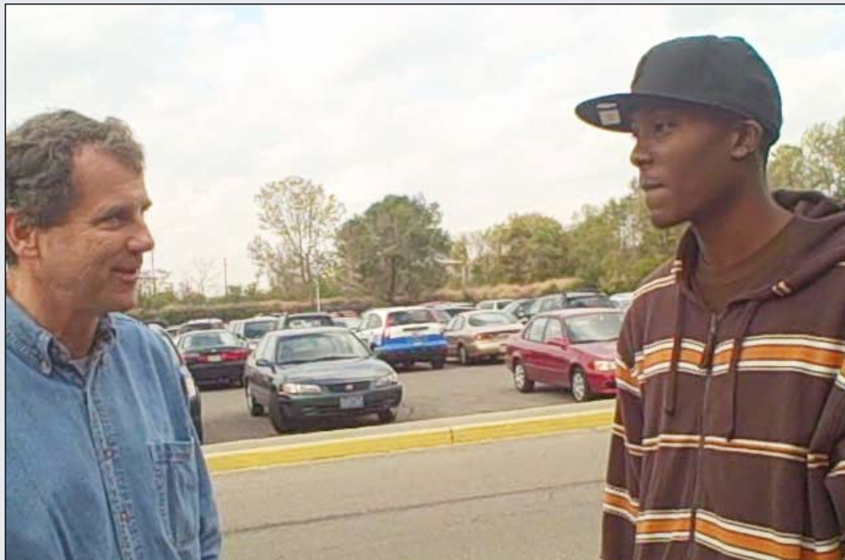
A YEP youth chats with Senator Sherrod Brown during early voting at Veterans Memorial in Columbus.