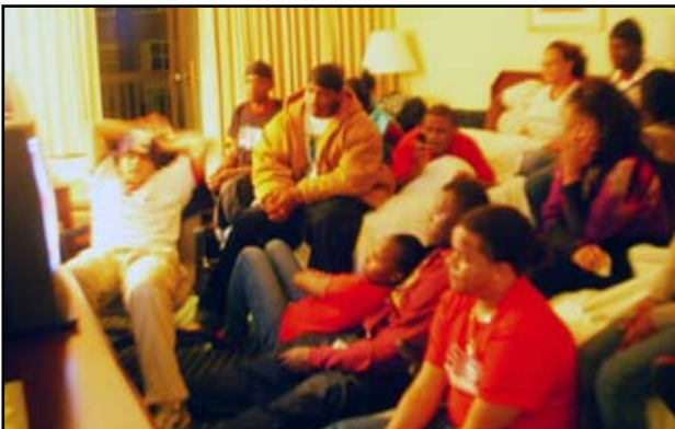
YEP youth watch OBAMA's acceptance speech in a hotel room in Akron on election night.