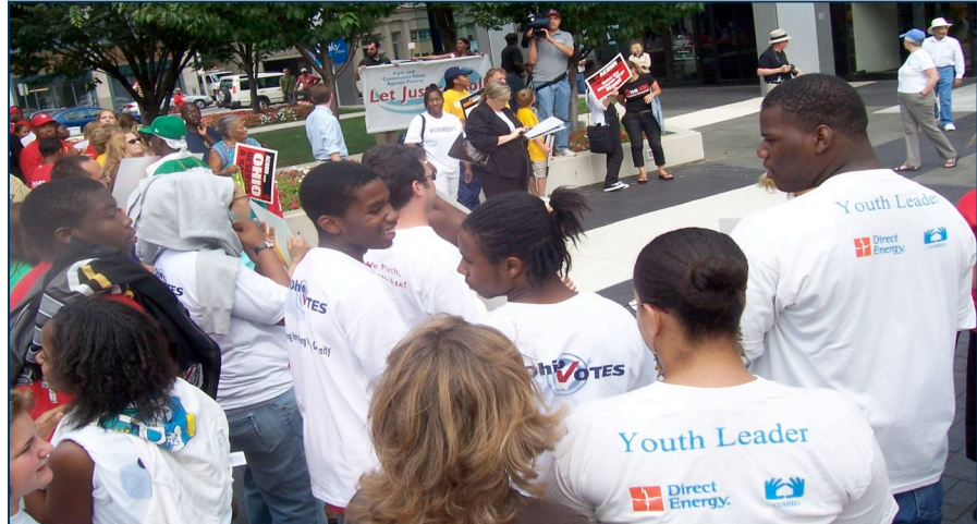
COHHIO's YEP and OhioVOTES youth join the rally in support of the "Raise the Wage" campaign